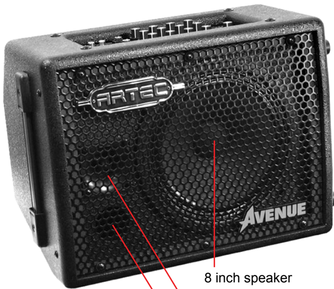
8 inch speaker 1 inch horn (not actual speaker) Bass reflex hole