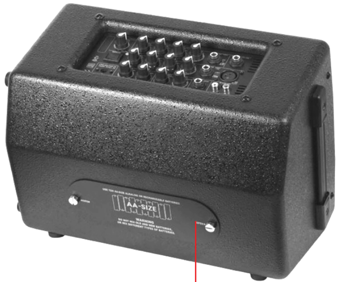
Battery Holder use ten AA size alkaline or rechargeable

DIMENSION : 275 x 360 x 250 (mm) SPEAKER : 8 inch LF OUTPUT : 20 watts music power DC POWER : Max 1A @ 15V POWER CONSUMPTION : 15W(DC) max FREQUENCY RANGE : 60Hz ~ 8kHz BATTERY LIFETIME : avg 8~10 hours (Alkaline)